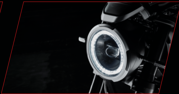
Full LED headlights