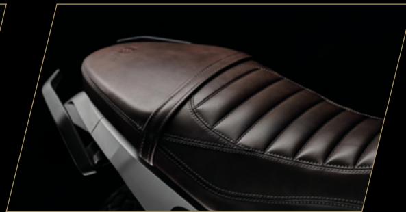
Standard passenger handles Brown heritage seat