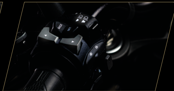
Backlit handlebar controls