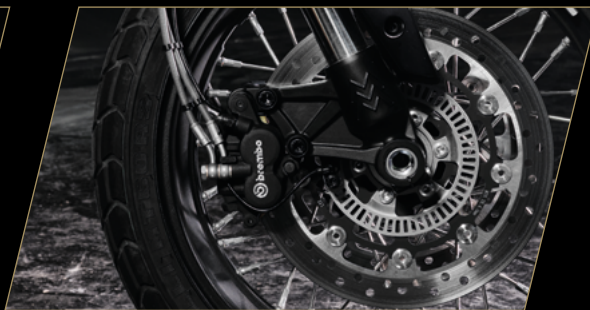
Brembo braking system Pirelli MT60RS tyres