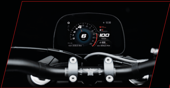
5-inch TFT screen