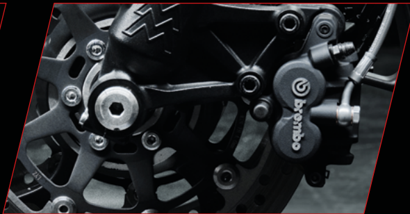
Brembo braking system