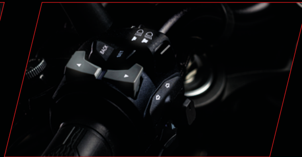
Backlit handlebar controls