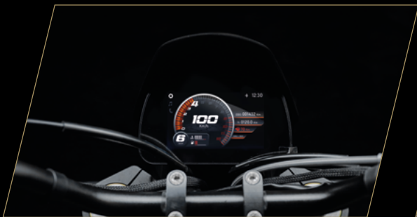
5" TFT screen Bluetooth connectivity