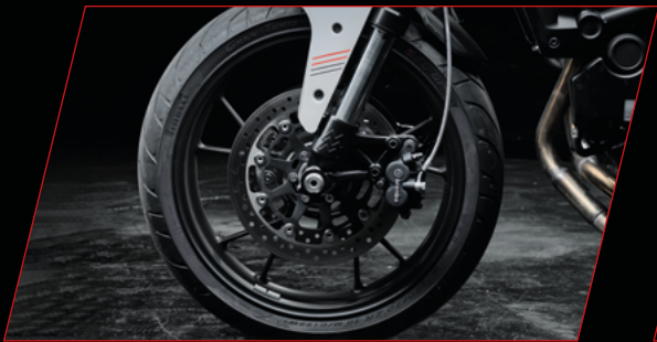
18" front and 17" rear Tubeless alloy rims