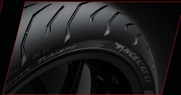
Pirelli Angel GT tyres