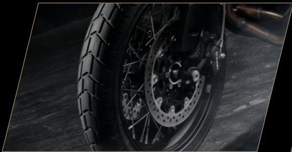
18" front and 17" rear Tubeless spoke rims Tyre pressure sensors